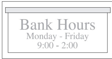
align, position both carrier sheets with masking tape