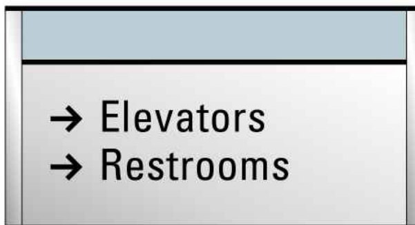
informational sign (directional)