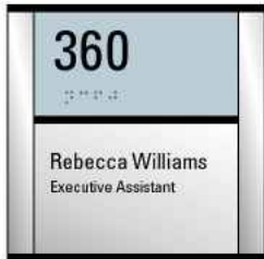
ADA sign (room number with changeable name insert)