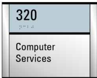
ADA sign (room number with changeable name insert)