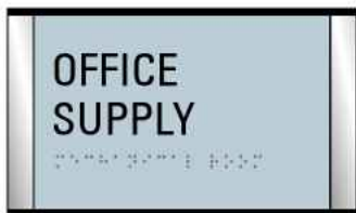
ADA sign (room name)