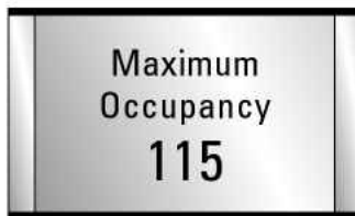
information sign (max. occupancy)