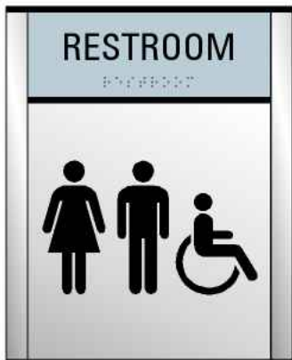
ADA sign (restroom)