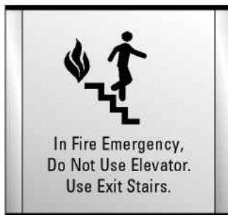
information sign (elevator lobby)